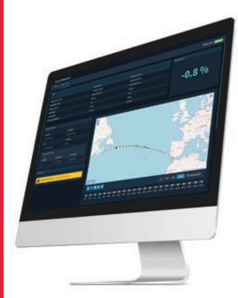
Learn about speed optimisation at stand 1.318

The company's Asset Technical Management software is used by a wide range of maritime companies, with operators such as Carnival Cruise Lines, Costa Crociere, AIDA, NCL, d'Amico and MSC Cargo having already implemented InfoSHIP across their fleets.