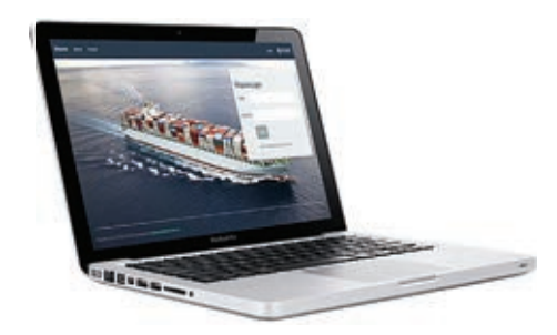
Check out vessel performance systems at stand 2.401

Ascenz Solutions is a provider of vessel performance systems for regulatory compliance, operational efficiency and risk management.